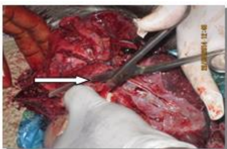
Fig.5: Sample collection after post-mortem

colored tubercle bacilli were observed in the lung specimen indicating that the monkeys were exposed to tuberculosis. The cell wall of tubercle bacilli contains (Fig.6) waxy material so it did not take dye at room temperature. But the bacteria took up stain with dye by prolonged application or by heating. When once the bacteria were stained, they resisted decolorization with acid alcohol, but the tissue could be decolorized and took the color of methylene blue. For this reason, bacilli looked red and the tissue looked blue in the acid fast staining result. In a study of Forero, M. et al., (2004), similar identification of red color TB organism was found by Ziehl-Neelsen method for acid-fast staining.