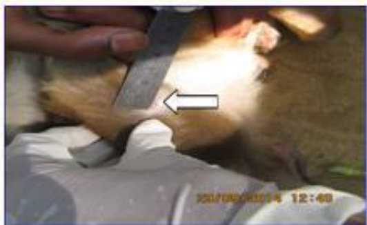
Fig.3: Swelling measurement after 72 hours