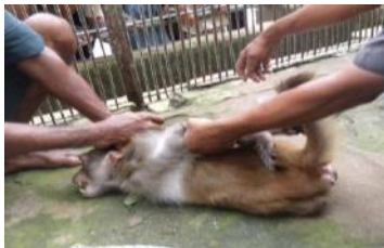
Fig.1: Capture of the monkey

(4) The capture of Monkey: In the quarantine shed the monkeys were live captured by the caretaker with the use of the net. During the capture, no monkey was injured and all safety measures had taken to check any critical condition. All the monkeys are captured in a humane way.