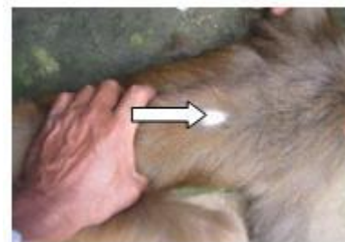
Fig.2: Marking for the identification of monkey

There were 29 monkeys in the primates quarantine section of the Chittagong zoo. For the study, we captured 14 monkeys which were marked by shaving (Fig.2) different area of the body for identification. Among 14 monkeys 6 were male and 8 female. The average age of male is 1.8 years and female is 2.1 years. Average body weight of the male was 3.02 kg and female 3.45 kg.