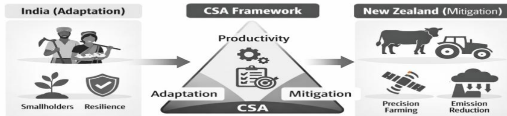
Fig 3: Comparative framework of climate-smart agriculture (CSA) systems in India and New Zealand, illustrating the integration of adaptation-focused smallholder resilience in India and mitigation-driven technological innovations in New Zealand within the three core CSA pillars—productivity, adaptation, and mitigation.

The findings suggest that an integrated CSA framework combining India's resilience-focused strategies with New Zealand's mitigation-driven innovations can significantly enhance global agricultural sustainability. Strengthening policy coherence, improving access to technology, and promoting farmer participation are essential for scaling CSA effectively (Pretty and Bharucha, 2021; Rosenstock et al., 2021; Roy et al., 2025; Sharma and Singh, 2025).