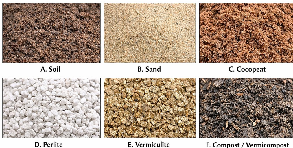
Fig.2. Common propagation media used for seedling production