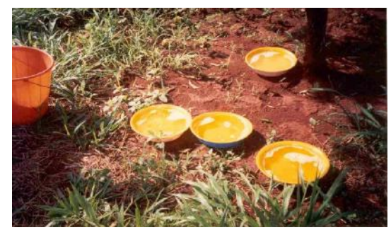
Fig.5: Moericke traps

A total of 9540 specimens were collected in western Minas Gerais with and 6287 in southern Goiás. The most abundant families were Ichneumonidae with 4562 and Braconidae with 2532. The Ichneumonidae was the most frequent family collected in the Moericke traps. Also, in the Malaise traps, the family Ichneumonidae was the most frequently found. The superfamily Chalcidoidea presented the highest diversity of families (10 families) in both trap types (Marchiori et al. 2002).