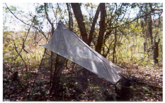
Fig.4: Malaise traps

The objective of this research work was to identify the genera of Braconidae collected in a remnant area of native forest located in Itumbiara County, State of Goiás, Brazil, using Malaise traps (Figure 4). Twenty-four samplings were performed from January to December 200. From these collections, 49 specimens from 19 different genera and 10 subfamilies of Braconidae were obtained. The subfamily Doryctinae had the highest diversity of genera. The number of specimens obtained was low considering the collection period. Chelonus was the most abundant genus comprising 34.7% of the specimens collected. Most specimens were obtained in the months of March and June, with 20.4% and 24.5% occurrence frequency, respectively. These results contribute to the knowledge of entomofauna occurring in the Itumbiara region, southern Goiás state, Brazil (Marchiori 2014).