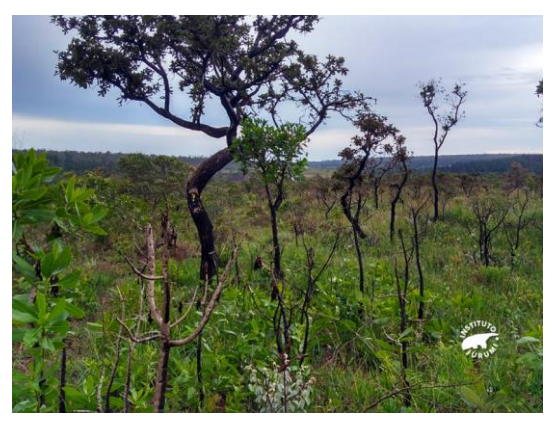
Fig.1: General aspect of the Cerrado.

Despite the unique characteristics of biodiversity, the Cerrado, along with the Caatinga, is the least protected area by the government. This biome has 8.21% of its territory legally protected by conservation units; of this total, 2.85% are full protection conservation units, in which only indirect uses are allowed; and 5.36% of sustainable use conservation units, in which the use of natural resources is compatible with nature conservation (Costa 2019).