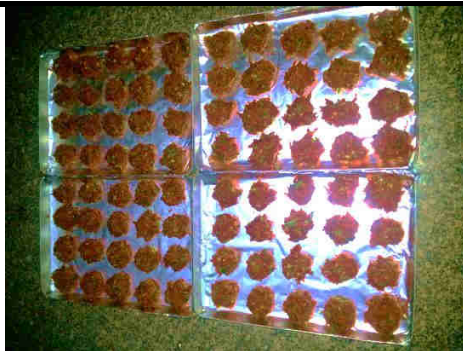
Fig. 2: Sandge samples in trays for drying