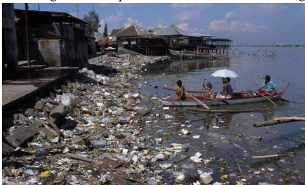
Fig.4: Depicts most of the garbage in water bodies is by plastic waste Locality