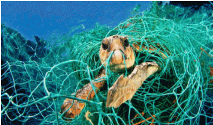
Fig.3: Shows animal getting trapped in the garbage thrown by humans