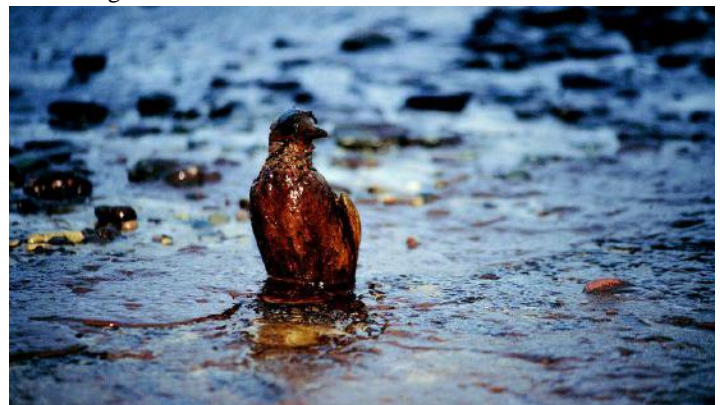
Fig.2: Animals beings effected because of chemicals and oil spills in water bodies

This report also shows that there are huge oil spills in the water bodies by the human beings which has been causing death toll to the animals and species residing in the oceans. According to the report more than 1,00,000 sea birds have died till date and it has not stopped. Also there have been more than 144 bald eagles that have also died till date.