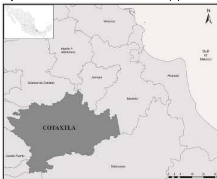
This study was carried out by means of a design and application of two surveys, one applied first to 30% of the total of papaya producers of the localities of Las Lomitas, Mata Espino, Mata Tambor, Loma de los Hoyos, Los Bajos del Tlachiconal and the municipal seat of Cotaxtla. This group of producers is constituted in an organized manner by an "Agricultural Grouping" which facilitated to carry out the surveys. The first survey was applied with an open-ended questionnaire in order to know: which groups of agrochemicals are currently used for the management of papaya crops; which are the main phytosanitary problems that they have during crops. And

pesticides are effective in controlling lepidoptera [10, 11, 2]. Thiamethoxam can last 3 years in soil, it is soluble in water and its use in crops can cause bee hives collapsing at concentrations of 0.1 to 0.5 \mu\text{g}/\text{hive} [15], whereby the Environmental Protection Agency (EPA) and the European Food Safety Authority (EFSA) set the maximum permissible limits in fruit trees of 0.4 and 0.05 \mu\text{g}/\text{L} . In addition, the damage caused to ecology and human health is innumerable. Therefore the aim of this study was to make a diagnosis of the use and management of thiamethoxam in a papaya agroecosystem, in the municipality of Cotaxtla, Veracruz in Mexico.